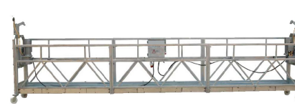
HOT GALVANIZED STEEL