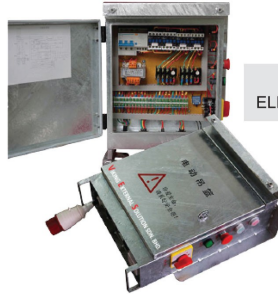
CONTROL ELECTRICAL BOX